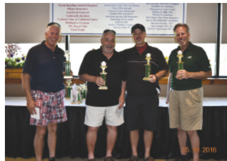
Amateur Champs - Scolaro Group