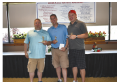
President's Champs - Gatins Group