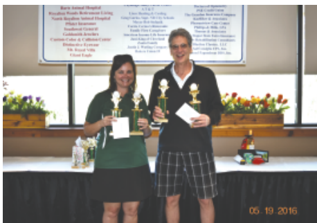
Recreation Champs - First Federal